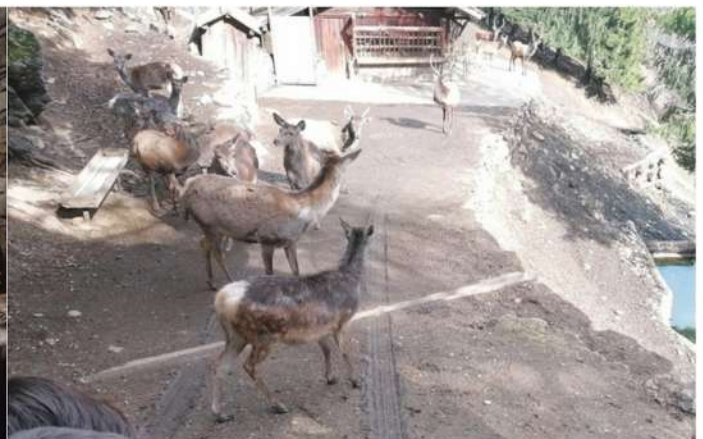
Pejo wildlife park.