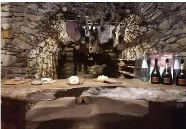
Local meat and cheese farm.